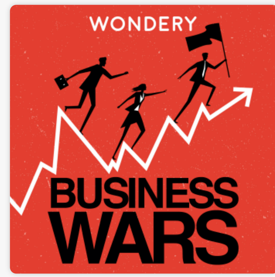
Business Wars Wondery