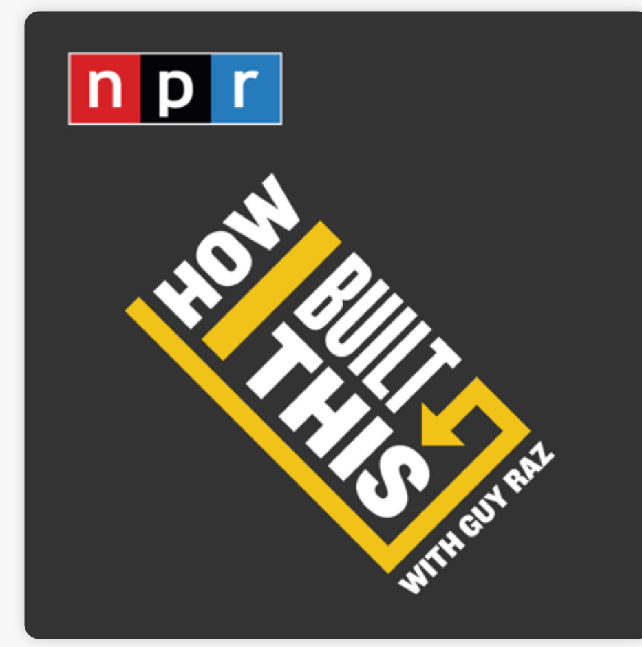
How I Built This Guy Raz