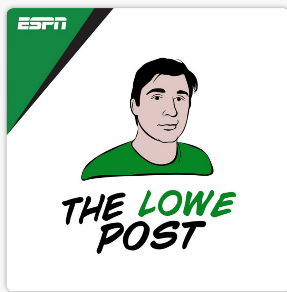
The Lowe Post ESPN