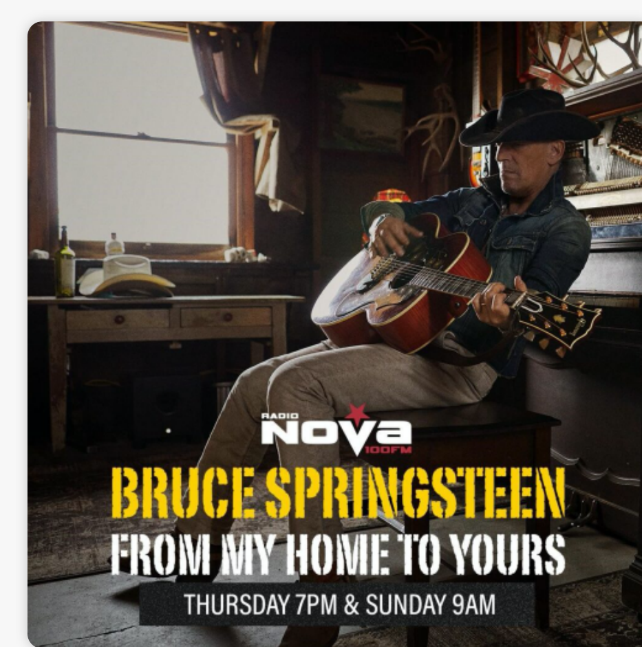
From My Home to Yours Bruce Springsteen