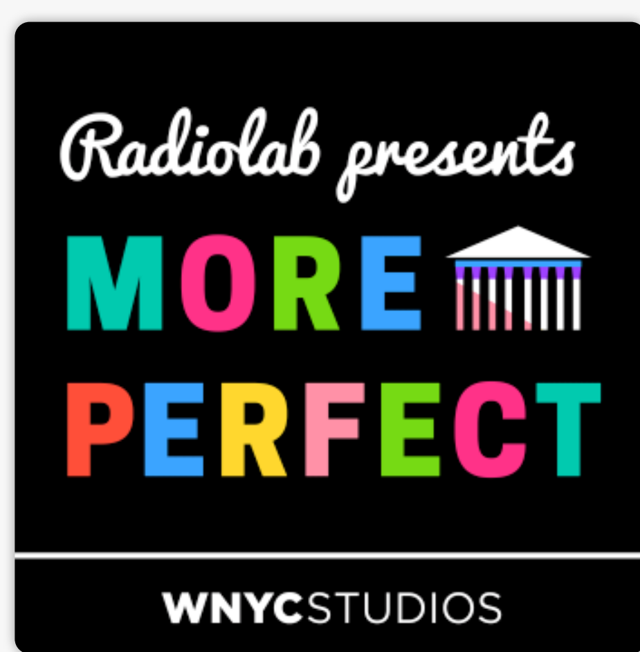
Radiolab's More Perfect WNYC Studios