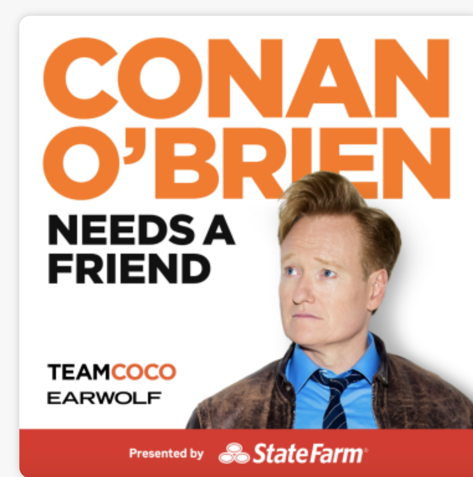
Conan O'Brien Needs a Friend Conan O'Brien