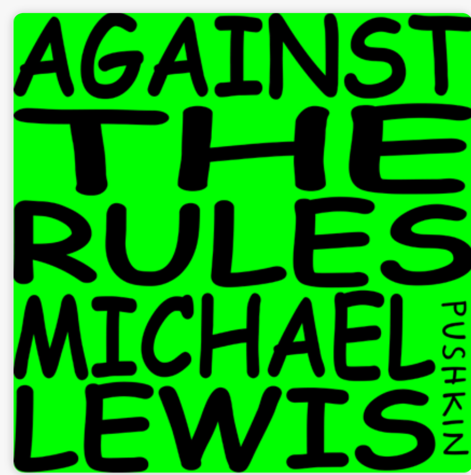
Against the Rules Michael Lewis