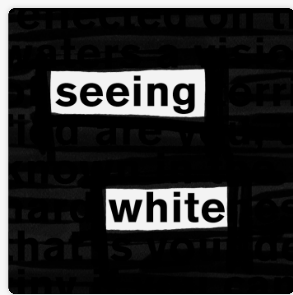
Seeing White Scene on Radio