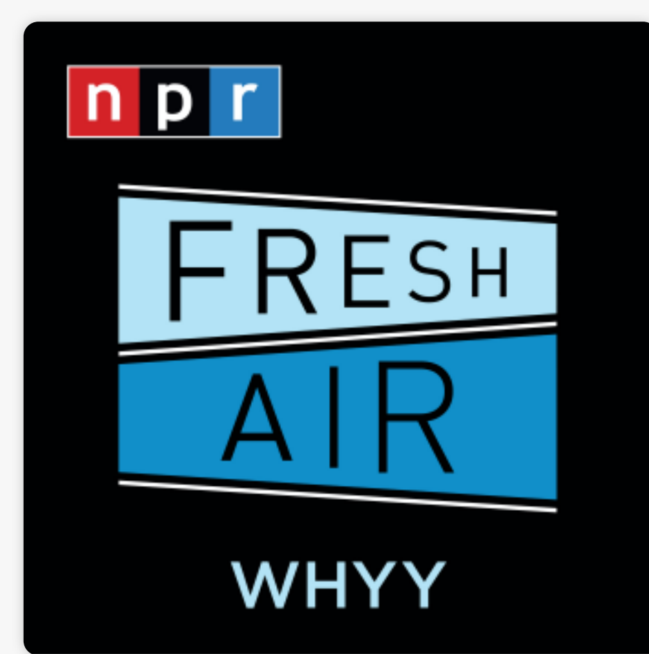
Fresh Air NPR