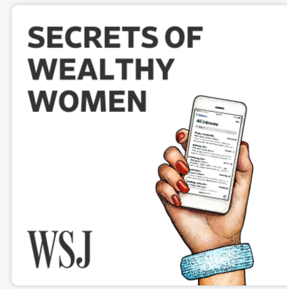
Secrets of Wealthy Women WSJ