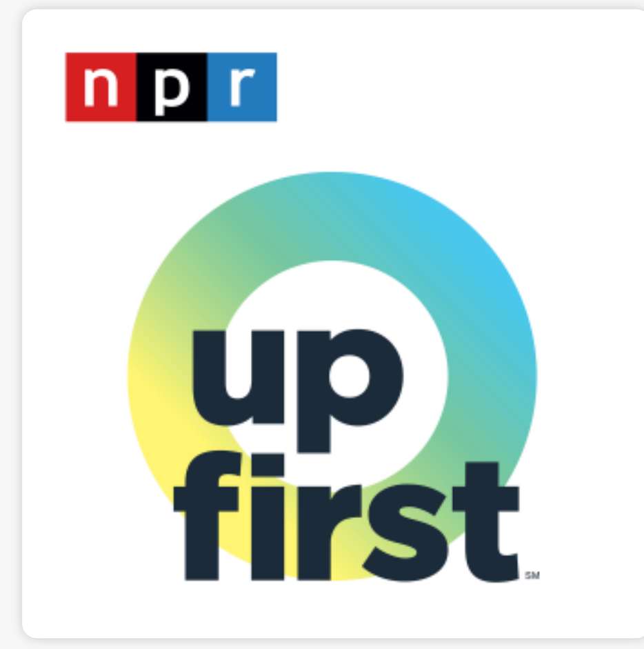
Up First NPR