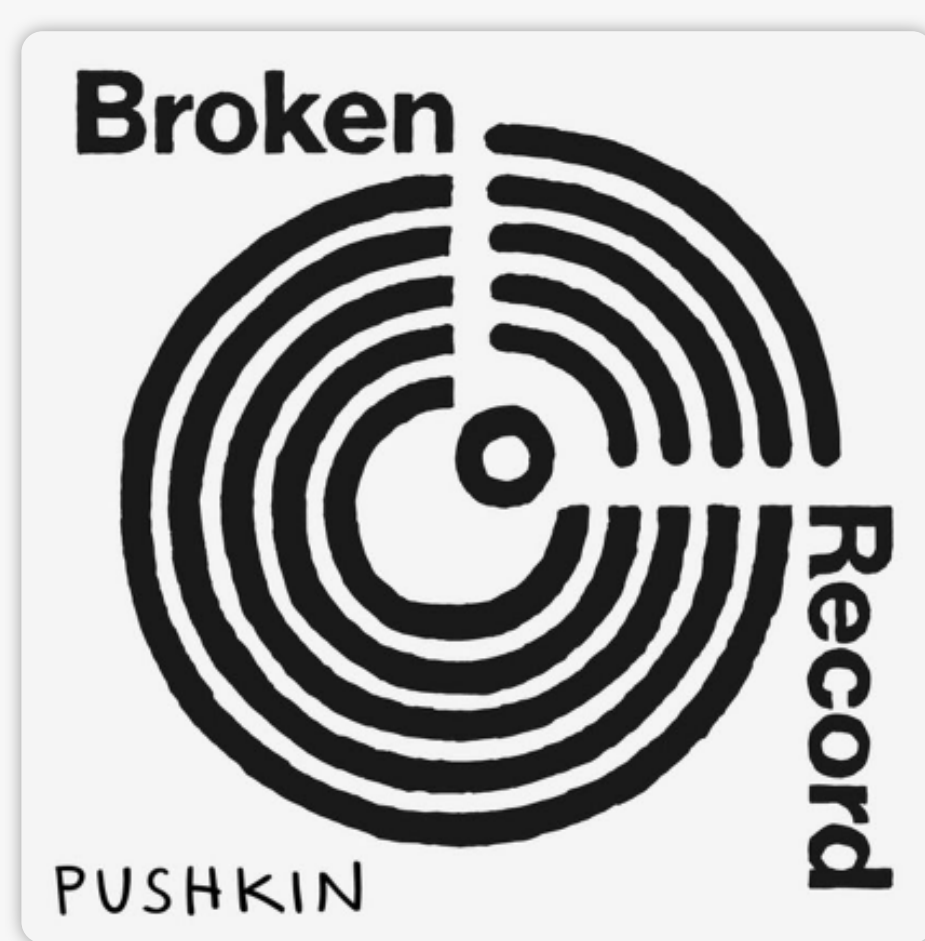
Broken Record Pushkin