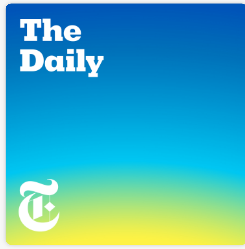
The Daily The New York Times