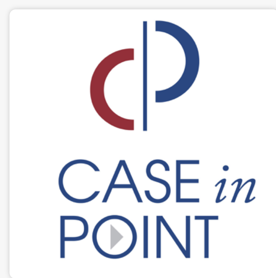
Case in Point UPenn Carey Law School