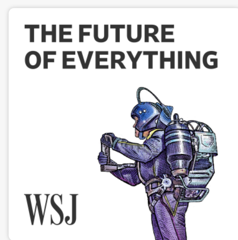
The Future of Everything WSJ