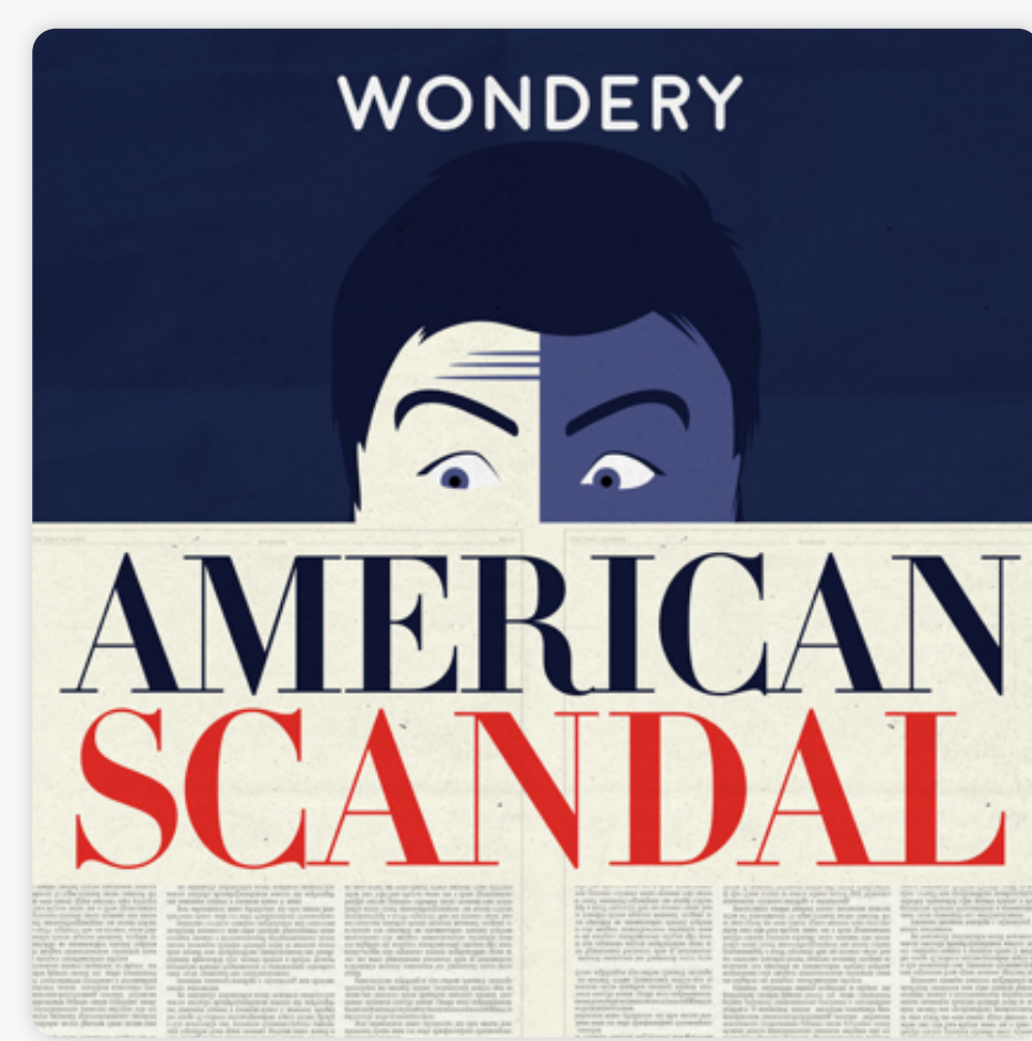
American Scandal Wondery