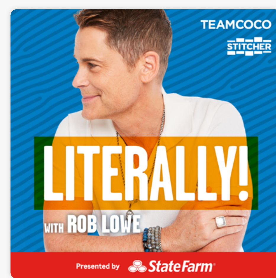
Literally! Rob Lowe