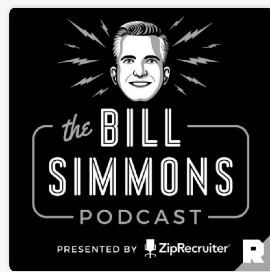
The Bill Simmons Podcast HBO and The Ringer