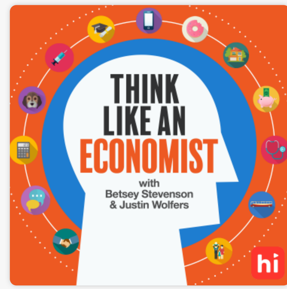
Think Like an Economist Betsey Stevenson and Justin Wolfers