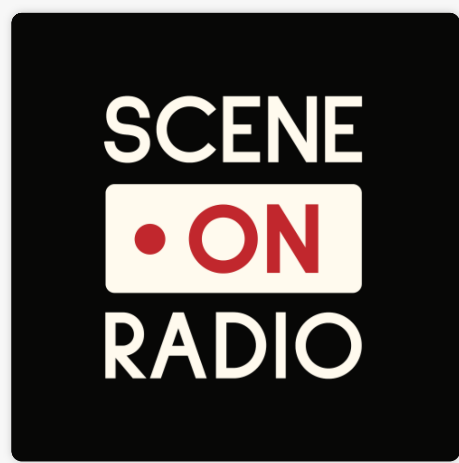
MEN Scene on Radio